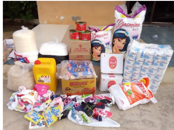
Food for the shelter children