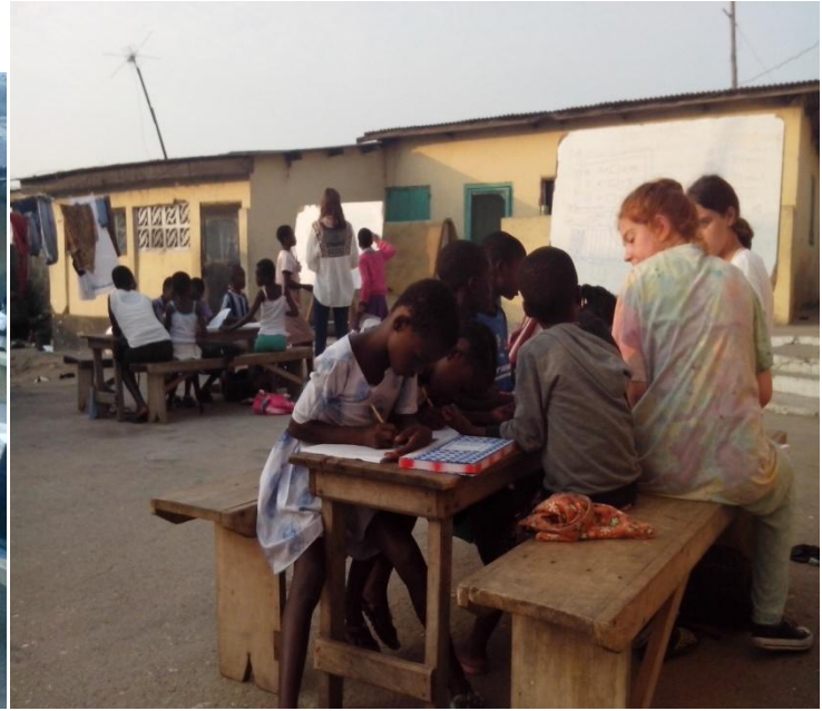
Fishing village project

We are very grateful for your donation and we ask for God's